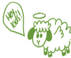
Eileen M. Cocco May 18, 1936 – Feb. 9, 2025

Bubbles. I love bubbles and experiencing them floating in the air. I am sure that everyone has experienced the joy of blowing bubbles. It is amazing to me that something so simple could bring so much happiness to so many people. It isn't just for kids either! I have even seen teenagers and adults laughing and having fun blowing bubbles and trying to catch them. There is just one problem with the happiness that comes from blowing bubbles; it doesn't last! The minute you reach out and touch one of the bubbles, it pops. Many times, we chase the bubble, but sometimes it's just out of reach, and as soon as it touches the ground, the bubble bursts. I think this is the way it is in the lives of many people today. A lot of people are chasing after happiness but, like bubbles, happiness is always just out of reach. Or just when we think we have it, our bubble may burst. What are some of the things that people are chasing in their search for happiness?