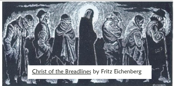
Christ of the Breadlines by Fritz Eichenberg