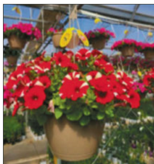
11" Specialty Baskets $25.00