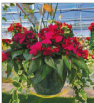
12" Combination Garden Baskets $30.00