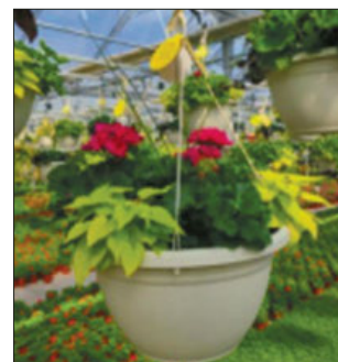
14" Geranium Combo Garden Baskets $40.00

Flower Baskets are from Woldhuis Farms Sunrise Greenhouse Nursery